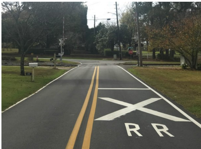
TIA funds made it possible for a number of road construction projects in Bleckley County, including the resurfacing of Lewis Street in Cochran.

Municipalities to use extra funds for discretionary transportation projects