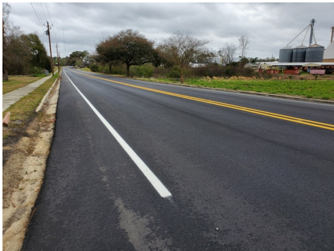
TIA funds made it possible for a number of road construction projects in Candler County, including the resurfacing of East Lillian Street in Metter.

Municipalities to use extra funds for discretionary transportation projects