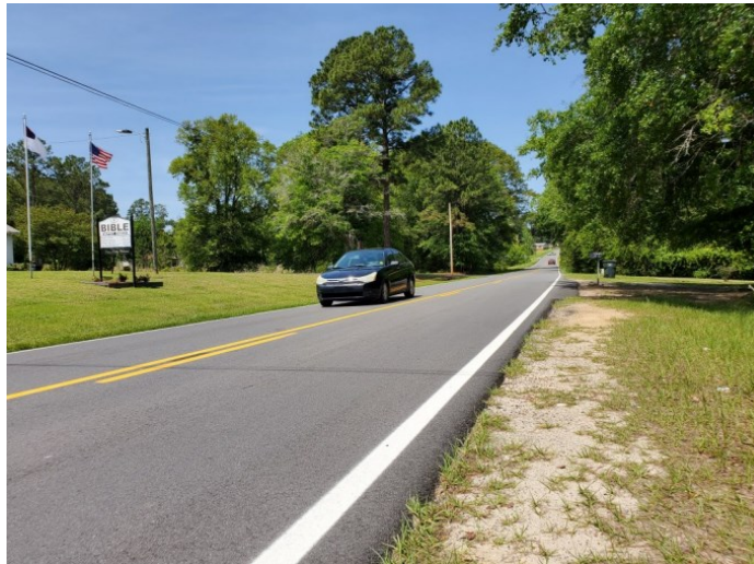
TIA funds made it possible for a number of road construction projects in Dodge County, including the resurfacing of Ward Street in Eastman.

Municipalities to use extra funds for discretionary transportation projects