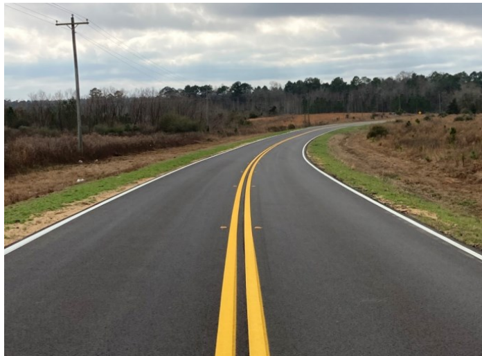
TIA funds made it possible for a number of road construction projects in Emanuel County, including the resurfacing of Pendleton Springs Road.

Municipalities to use extra funds for discretionary transportation projects