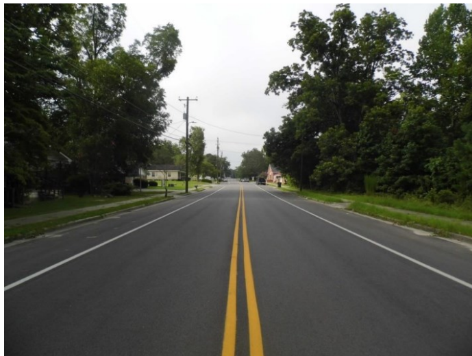
TIA funds made it possible for a number of road construction projects in Evans County, including the resurfacing of Church Street in Claxton.

Municipalities to use extra funds for discretionary transportation projects