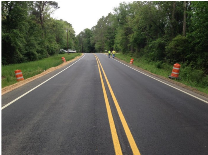
TIA funds made it possible for a number of road construction projects in Montgomery County, including the resurfacing of Thompson Pond Road.

Municipalities to use extra funds for discretionary transportation projects