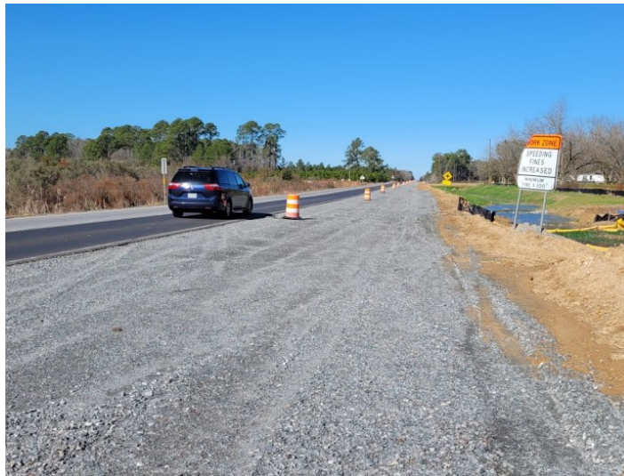
TIA funds made it possible for a number of road construction projects in Tattnall County, including the addition of passing lanes to a portion of SR 23/SR 57.

Municipalities to use extra funds for discretionary transportation projects