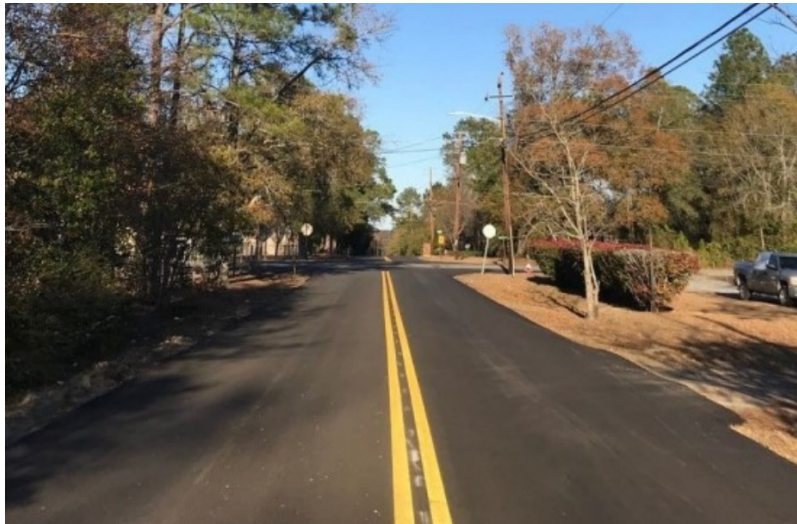
TIA funds made it possible for a number of road construction projects in Telfair County, including the resurfacing of Spring Avenue in McRae-Helena.

Municipalities to use extra funds for discretionary transportation projects