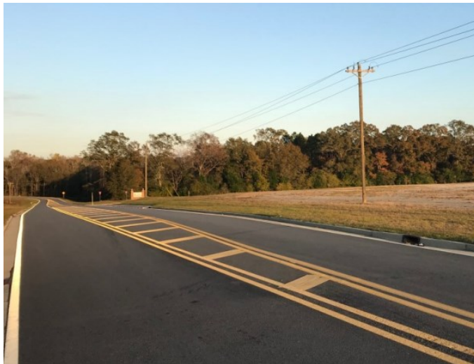
TIA funds made it possible for a number of road construction projects in Toombs County, including the conversion of Ezra Taylor Road from dirt to asphalt-paved.

Municipalities to use extra funds for discretionary transportation projects