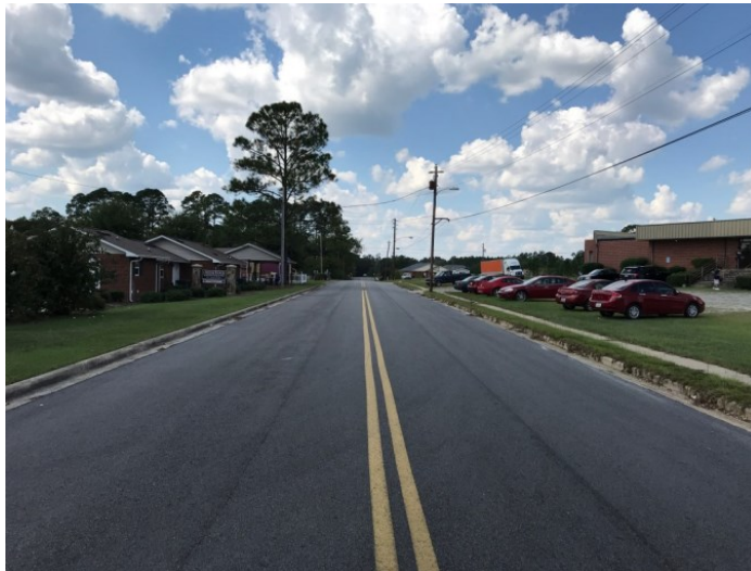
TIA funds made it possible for a number of road construction projects in Treutlen County, including the resurfacing of Arch Street in Soperton.

Municipalities to use extra funds for discretionary transportation projects