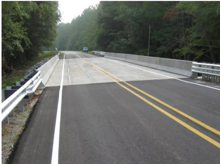
TIA funds made it possible for a number of road and bridge construction projects in Wayne County, including the replacement of the Walter Griffis Road bridge at Goose Creek.

Municipalities to use extra funds for discretionary transportation projects