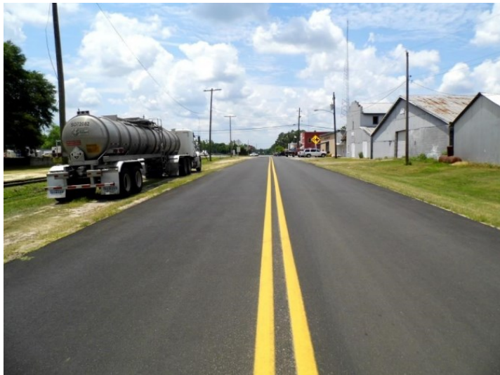
TIA funds made it possible for a number of road construction projects in Wheeler County, including the resurfacing of Railroad Street in Alamo.

Municipalities to use extra funds for discretionary transportation projects