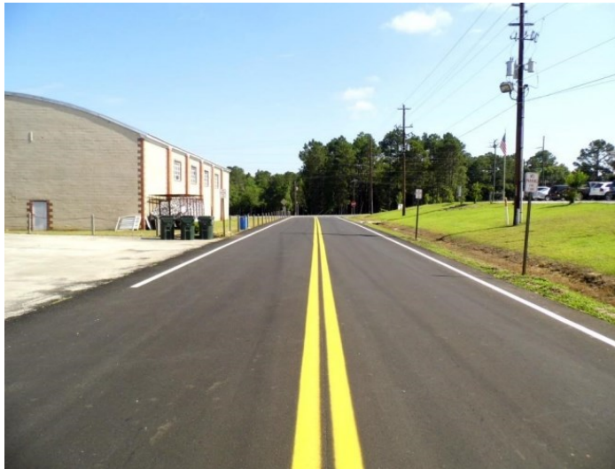
TIA funds made it possible for a number of road construction projects in Wilcox County, including the resurfacing of Bell Street in Abbeville.

Municipalities to use extra funds for discretionary transportation projects