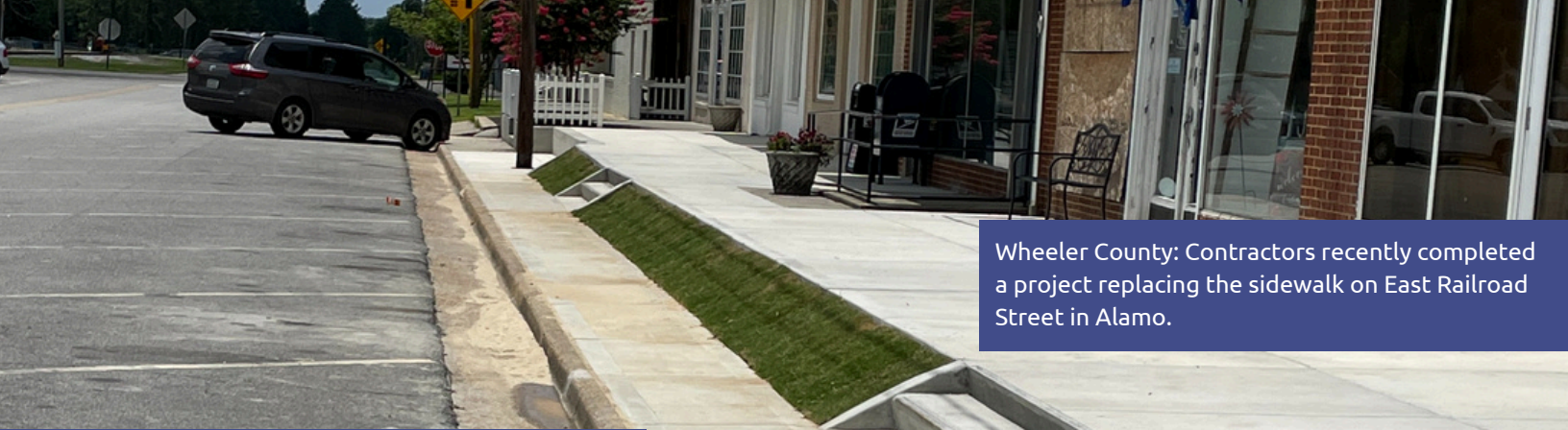
Wheeler County: Contractors recently completed a project replacing the sidewalk on East Railroad Street in Alamo.