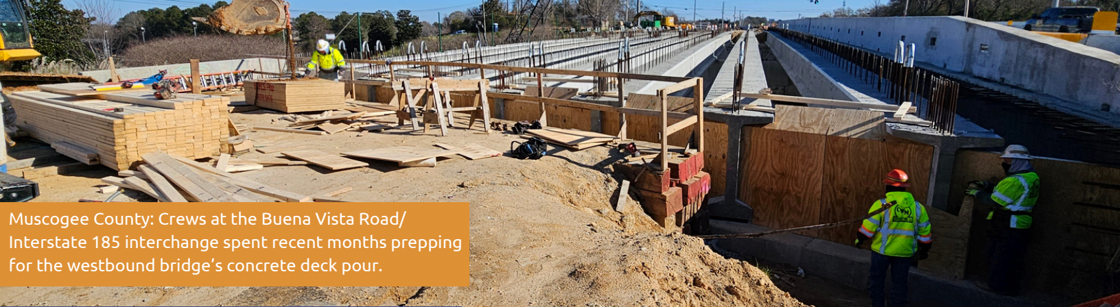
Muscogee County: Crews at the Buena Vista Road/ Interstate 185 interchange spent recent months prepping for the westbound bridge's concrete deck pour.